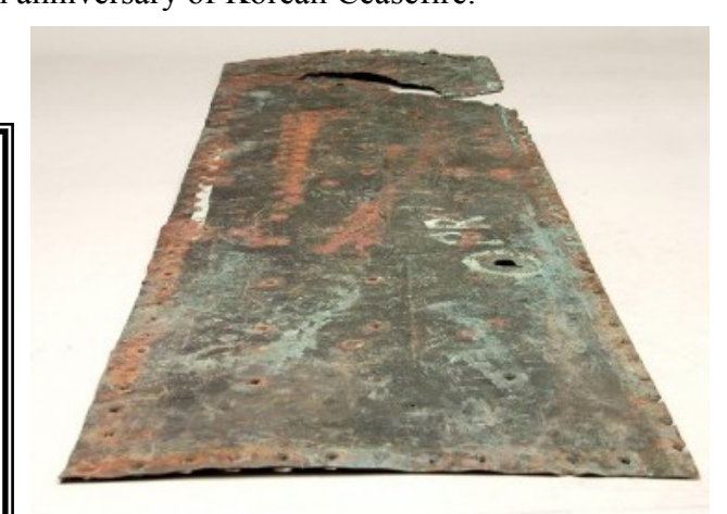
Piece of the original copper sheathing from HMS Victory

Ramada Conference Centre 11834 Kingsway Ave. Edmonton August 17th, 9:30 AM—5:00 PM, August 18th, 10:00 AM—4:00PM Over 100 display tables.