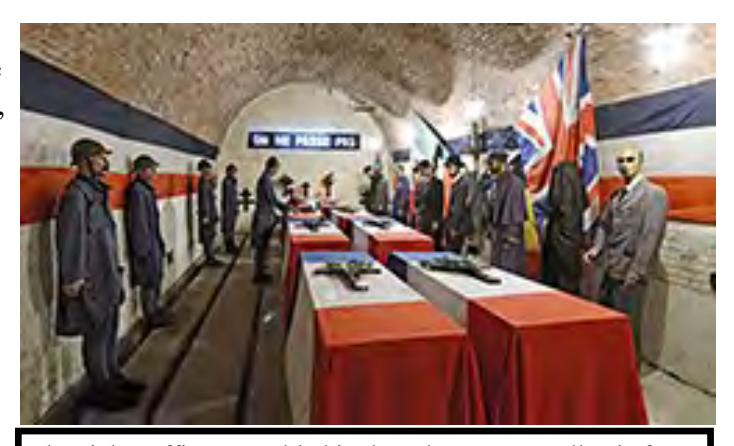
The eight coffins assembled in the subterranean galley before the selection

On October 22, 1922 the French Parliament declared the eleventh day of November in each year to be a national holiday. The following year on November 11, 1923 Andre Maginot, French Minister for War, lit the eternal flame for the first time. Since that date it has become the duty of the Committee of the Flame to rekindle that torch each evening at twilight.