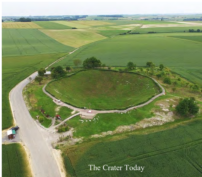
The Crater Today