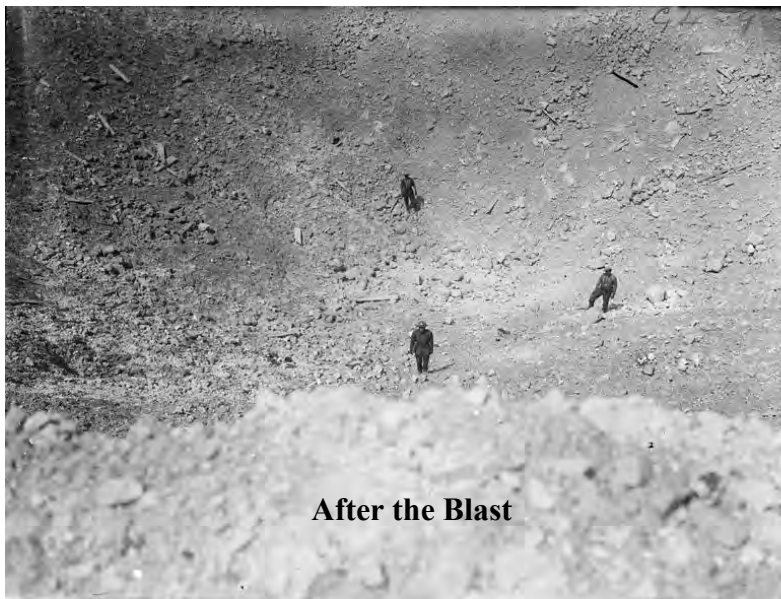
After the Blast

In the Lochnagar inclined shaft, at about 50 feet (15 metres) below ground level, a gallery was driven towards the German strong point called the Schwaben Höhe. The final depth of the explosives chambers was about 52 feet (16 metres).