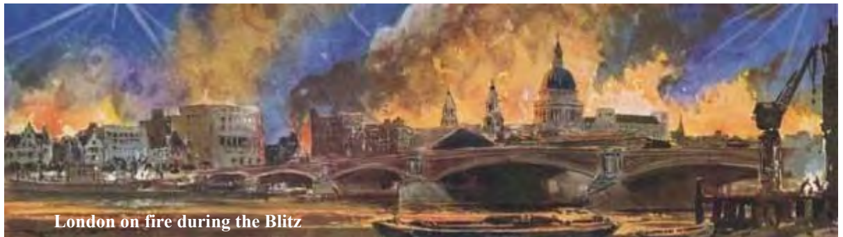
London on fire during the Blitz

Following a visit to the United Kingdom in early 1941 by the Prime Minister, Rt. Hon. W.L. Mackenzie King, the Canadian Government, at the request of the British Government, agreed to form and maintain a Corps of Canadian Fire Fighters who were to serve in Britain.