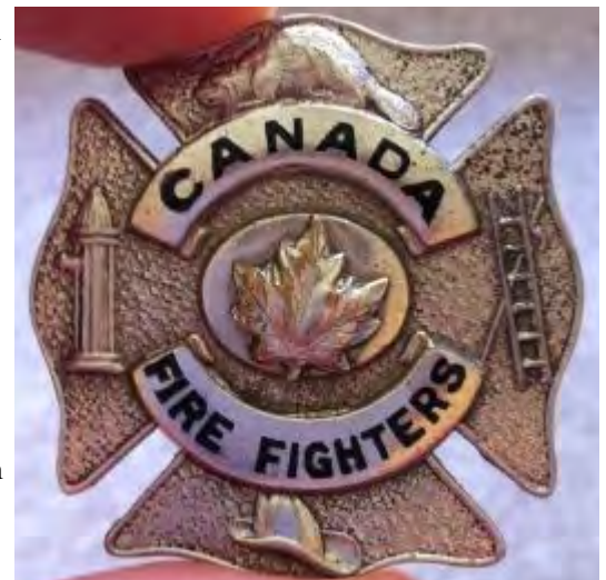
Canadian Fire Fighters WW2 Badge

The Fire Fighters attended all the lull-period fires in their district as well as fires caused by enemy action. They did fire duties in the docks anytime the ships were loading munitions, T.N.T., petrol or any other dangerous cargo. Many fires were stopped on ships by their quick action.