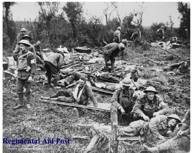
Regimental Aid Post

At the Petty Officers' Mess HCMS Tecumseh