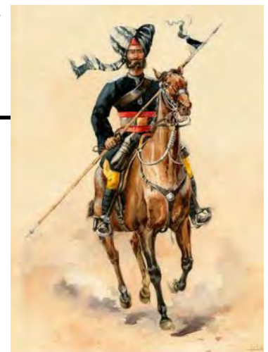
2nd Regiment of Bengal Cavalry