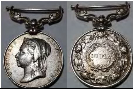
Long service and Good Conduct (20 years)

"murraba" is 25 acres. The medals also survived the partiton of India 1947, as the family moved from now Pakistan into Present day India. Finally I have also sent a picture of the Tel-El-Kebir clasp, the medal, claw suspender has been lost. I know the 2nd Bengal served in Egypt in September 1882 and some re-search has suggested the 17th Bengal Cavalry was disbanded in 1882. Note the medals are inscribed "17 Bengal Lancers" and Soonder Singh After sending the pictures