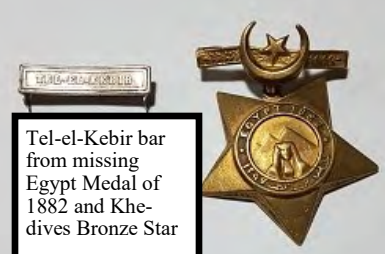
Tel-el-Kebir bar from missing Egypt Medal of 1882 and Khedives Bronze Star