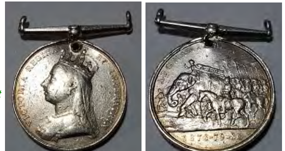
Afganistan medal dated 1878-79-80