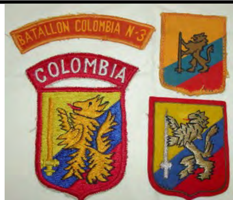
Columbian Army Uniform patches