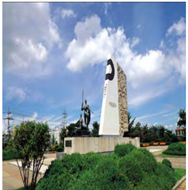
Memorial to Colombian Veterans, Incheon, Korea.