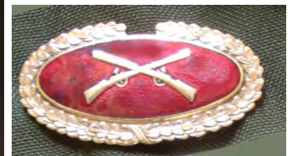
Columbian Korean War Veteran with official and non official medals

Very similar to the wound badge but it is slightly less elongated and the wreath is open at the top. The center depicts antique crossed muskets from the period of Colombia's struggle for independence from Spain circa 1819