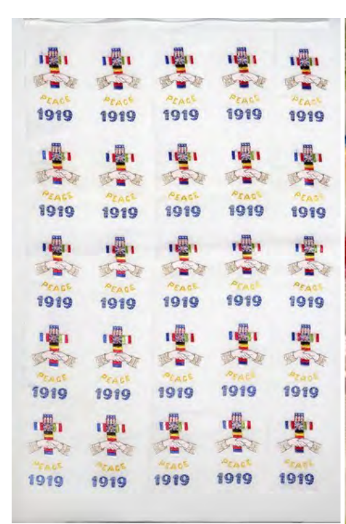
A set of 25 images that were pre-embroidered by machine. The images are ready to be cut out and glued onto a card ground. The main text on the card reads: "Peace 1919"

The large sheets and the lack of drawn or printed designs, and the sheer number of embroidered cards, indicates that the cards were machine made, but this brings us to the next question, which type of machine was used?