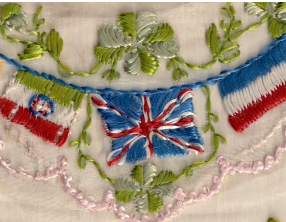
Detail of postcard showing various embroidery stitches, including the cross stitch, satin stitch and stem stitch