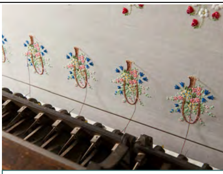
Detail of a hand embroidery machine in use.