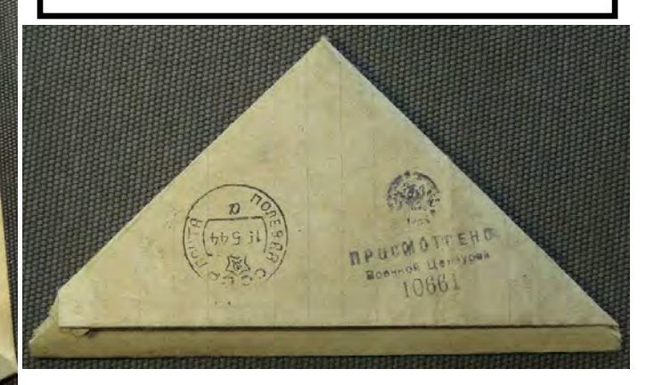
Rear of envelope shows the Censor's stamp "Checked by Censor" and the date of July 15th, 1944

The front of the envelope would have the families address, the soldier's name and number of field post.