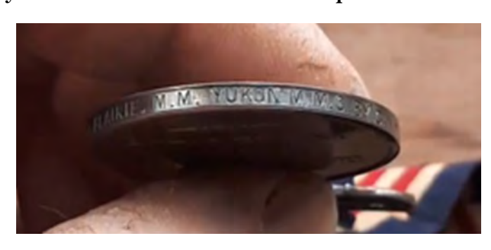
"... M.M. YUKON M.M.G.BY ..."