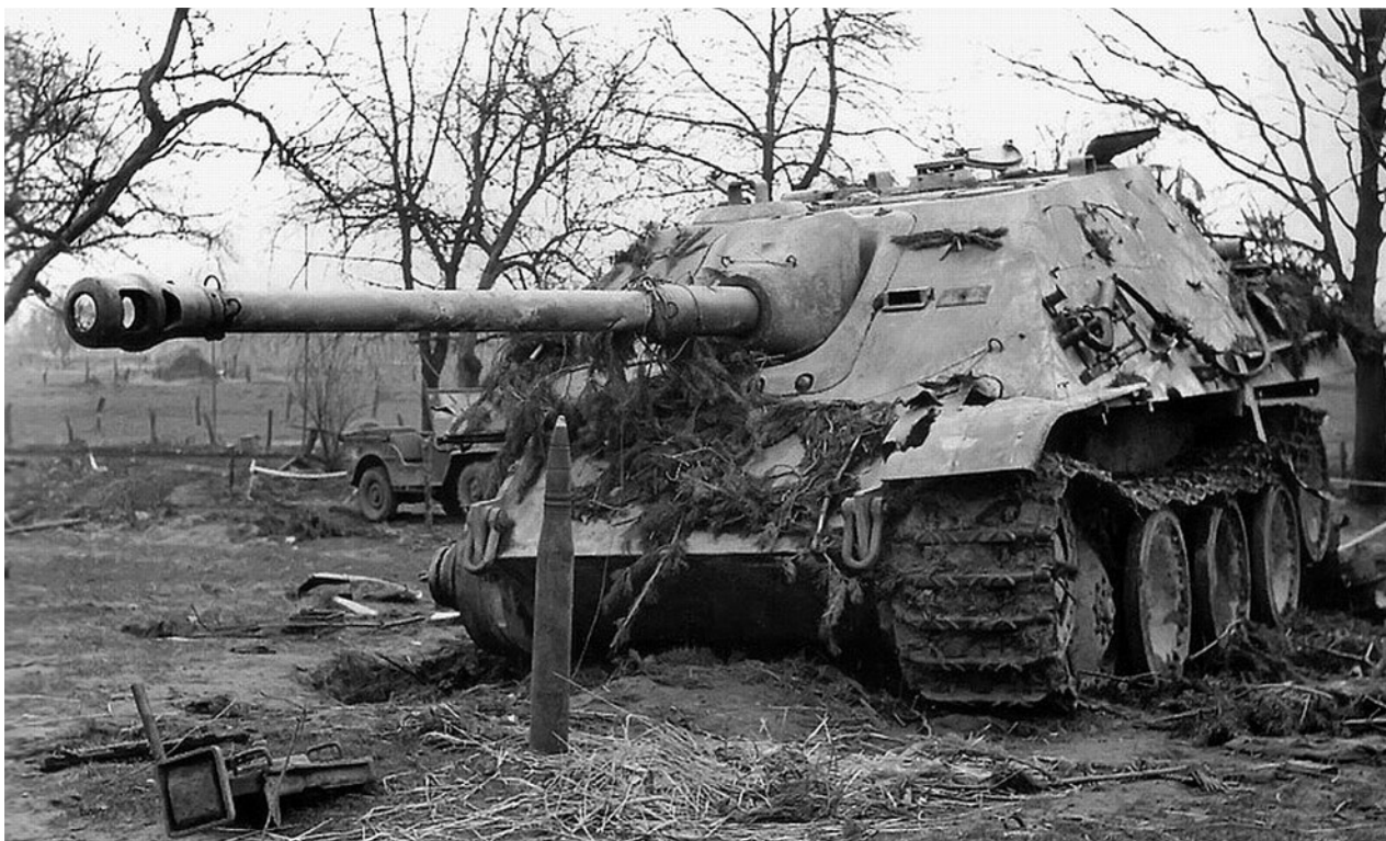
The 88mm self-propelled gun that wounded Deluca was most likely a Jagdpanther, which Allied troops frequently encountered in Normandy.