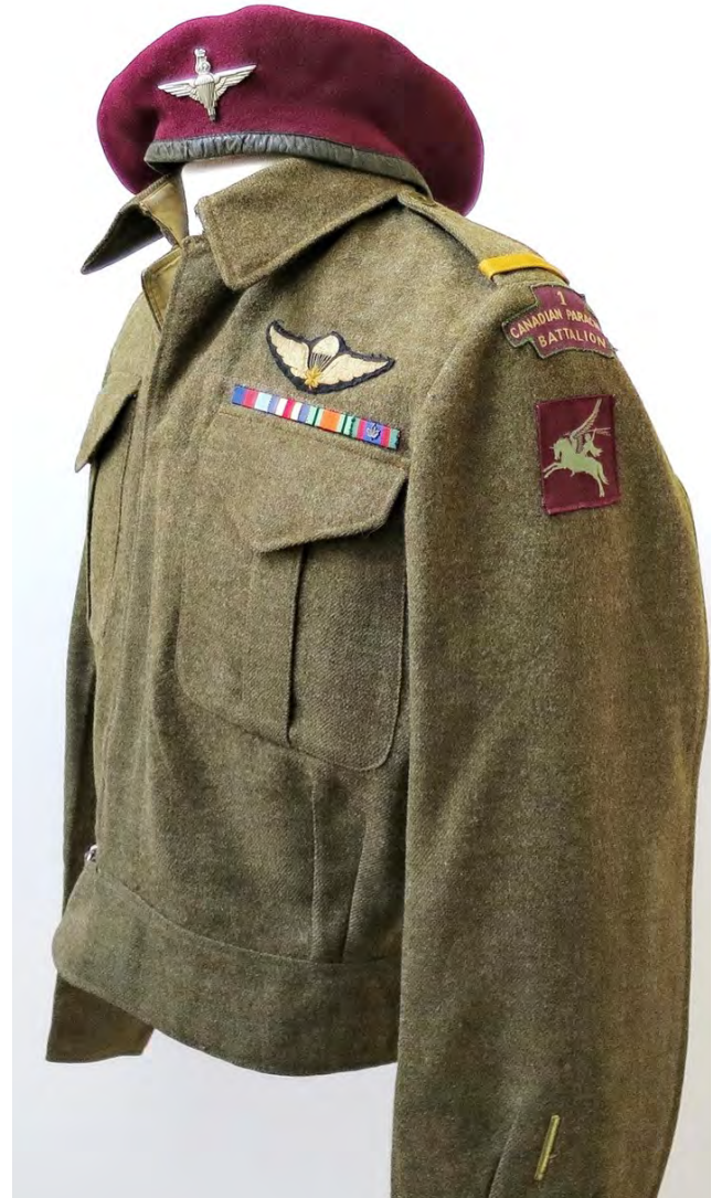
The Battle Dress retains its original gold-coloured Battalion Identification Strips.