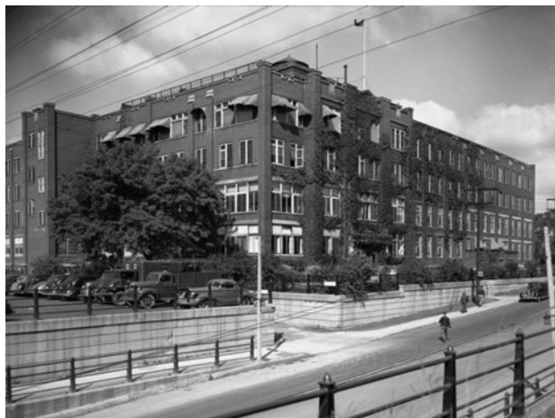
Christie Street Veteran's Hospital, Toronto c.1940.