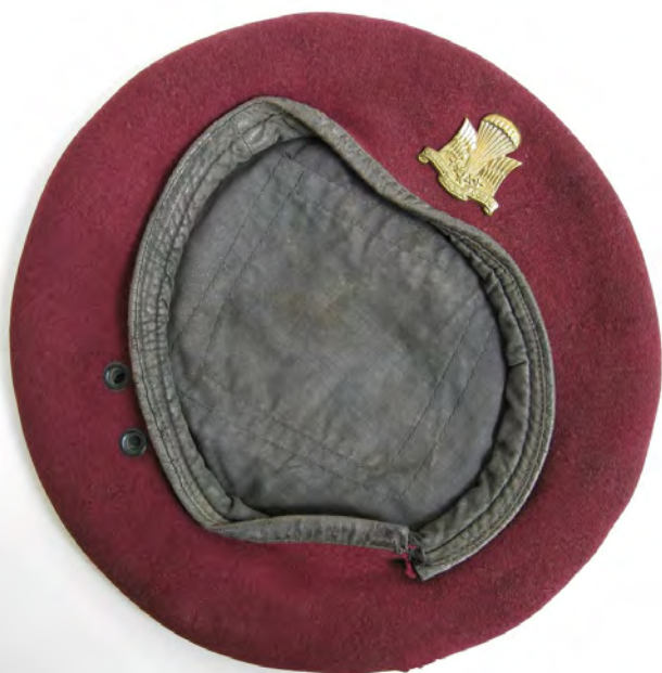
Ogburn's UK-made Beret with Z-Code WD Stamp (1945 manufacture)