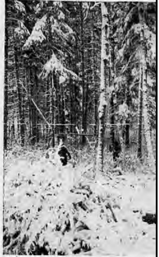
TOO MUCH FOR NAZIS: This is the north country that was too tough for 19 wandering Nazis who spent one night the bush near a northern Manitoba prison camp, then limpe back to the enclosure. They weren't escaping, they said, the were merely lost. A Tribune photographer took this phot outside the Riding Mountain National Park prison camp.

Meanwhile, the nineteen men had no idea they were considered escapees. Having left the camp that afternoon, the group had only intended on going for a hike to explore their new surroundings. Unfamiliar with the terrain and the weather - the POWs had left camp in their army uniforms and had taken no provisions. Following the old logging roads and game trails that dotted the area, the POWs soon became lost. Snow began to fall, and the storm escalated to a blizzard, covering all trails and tracks. Realizing their predicament, the POWs settled down for the night.