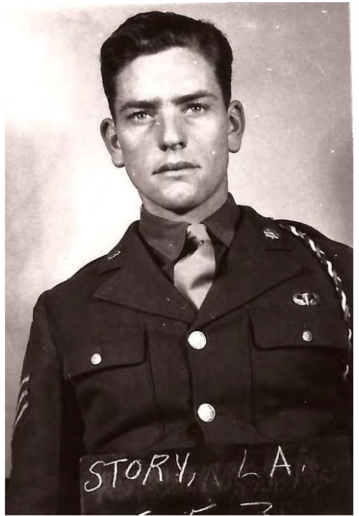
On 26 August 1942 he became parachute-qualified after only one week of training and 2 jumps from a C-47 Dakota. In addition to parachuting, the extremely challenging training regimen included mountainclimbing, small arms, demolitions, hand-to-hand combat and intense physical training. He recalls marches of almost 100 kilometres with heavy packs,

"It was kinda tough going because there was blood running out of the toes of your shoes...Some of the guys passed out and the stronger guys just picked them up". ^{i}