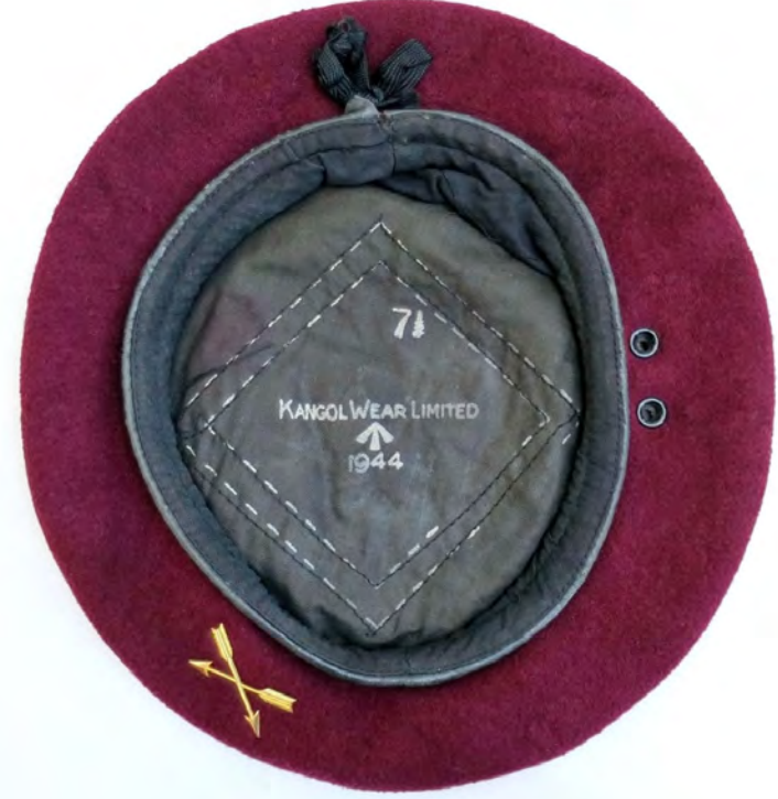
Lieut. Story's 1944-dated Kangol beret