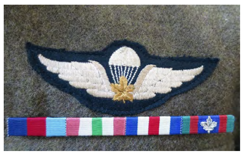
The wing is a UK-made Type 5