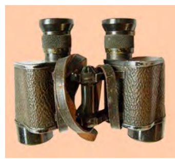
Wray 6x30 (RAF)

The workhorse binoculars for all major armies in World War II were 6X30 Binoculars manufactured by various optical companies.