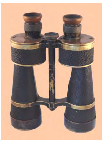
Deinst 10x50 (DAK)

Several British optical companies provided binoculars for the armed forces