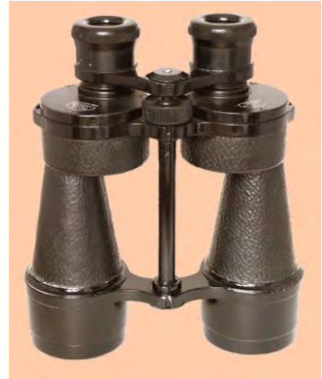
Ross 7x50 (Army)