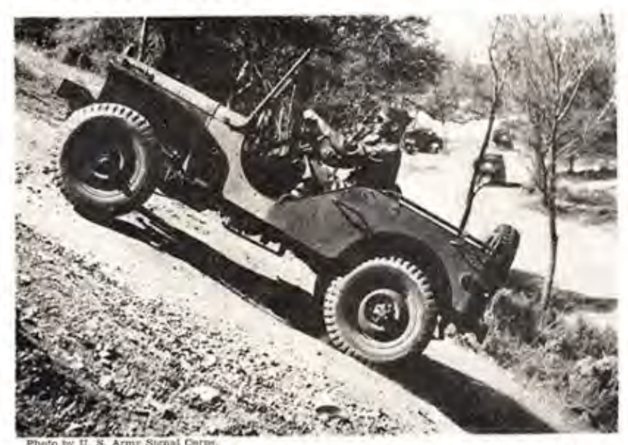
Steep grades, sand, other tough going are trivia to a "blitzbuggy"

Designed merely to replace the motorcycle, gruelling tests showed that the jeep could fight as well as run. And it could go places a motorcycle couldn't. Besides, a motorcycle dispatch rider is vulnerable; a single sniper can cut him down, letting vital orders fall into enemy hands. A jeep, carrying armed men and machine guns, is a far tougher proposition. And, vital for combat strategy, the jeep