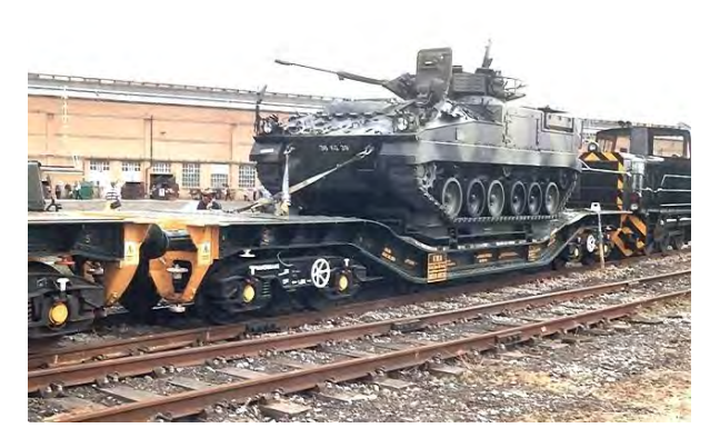
Carrying a modern fighting vehicle

An official photograph of a train of 50-ton 'Warwell' wagons carrying Sherman tanks. The nearest wagon is labelled as on loan to the LMS, which is consistent with the LMS brake van to the right of the photo.